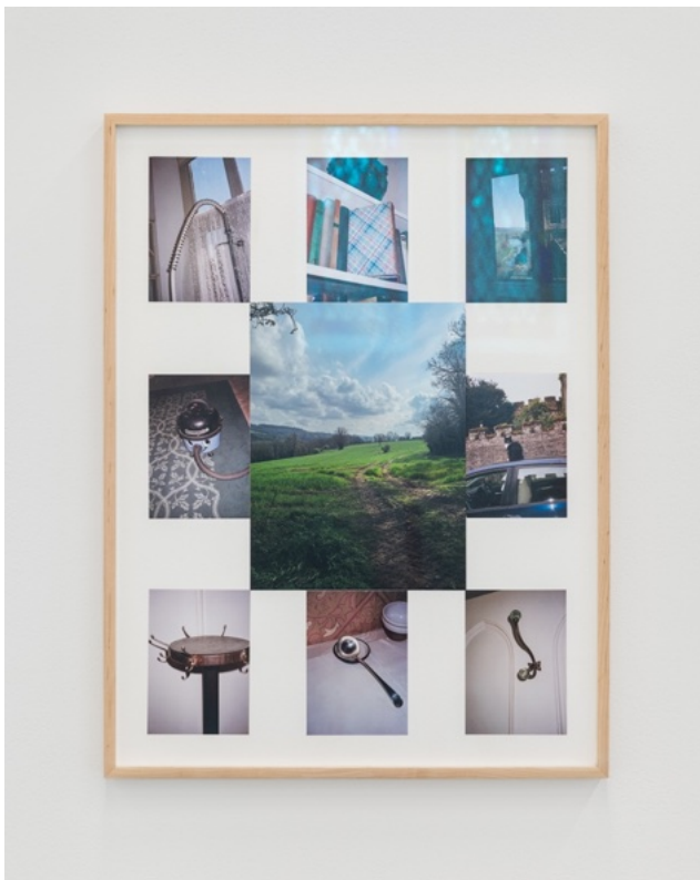
Don't Push The River (It Flows By Itself), 2024 57.6 x 43.7 cm