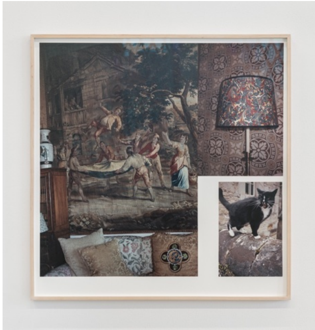
Echt, 2024 71.2 x 69.6 cm

Works Courtesy the Artist and Canada, New York.