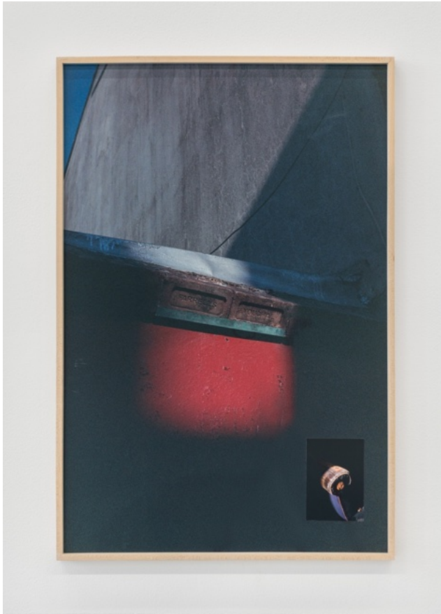
Kiss of the Sun, 2024 77 x 51.8 cm