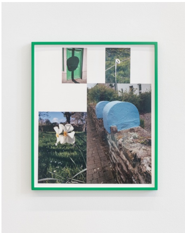
Sunny Spell, 2024 52.5 x 44.5 cm